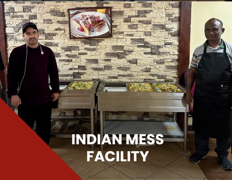
INDIAN MESS FACILITY